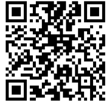
Trunk or Treat Book Fair Volunteers