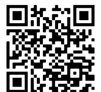
Library Helpers Form