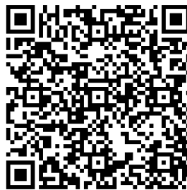
PTA Board Interest Form

If you are interested in having a role on our board or a committee, have someone you think would be fabulous at a certain role, or even just want to hear more about the different positions/ want to be involved but are unsure where you would best fit- please fill out our form here!